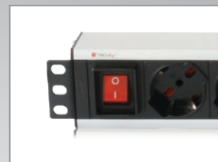
On/off lighting switch