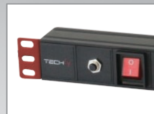
Switch and overload protection